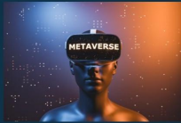
The Metaverse in Medicine

The Pre-Medical Academy is seeking passionate and knowledgeable doctors, clinical researchers, and other healthcare practitioners who want to become part of our esteemed faculty. By joining us, you'll have the opportunity to inspire and educate the next generation of healthcare professionals while delving into cutting-edge topics that are shaping the medical landscape.