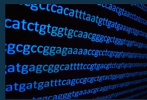
All the "Omics"